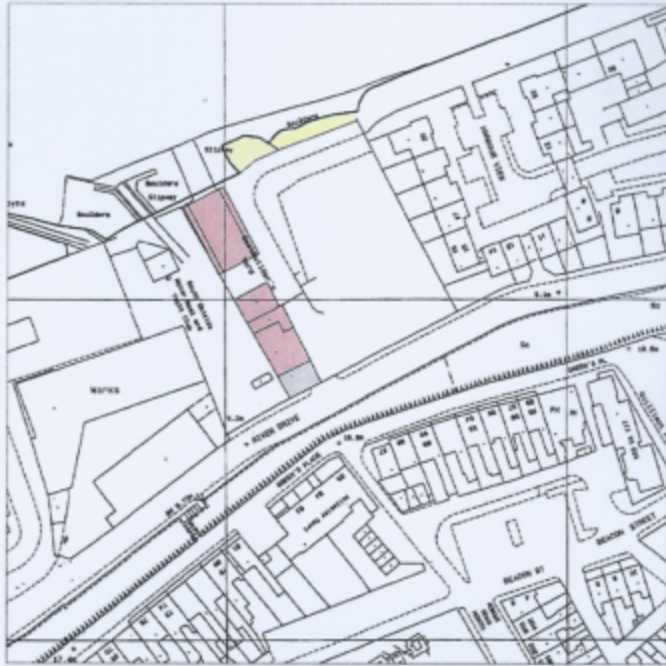
Ordnance Survey Plan - Existing Facility