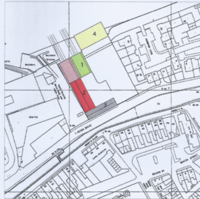
Ordnance Survey Plan - Proposed Development