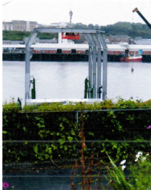
Fig 2. FRAMES Sept-2013